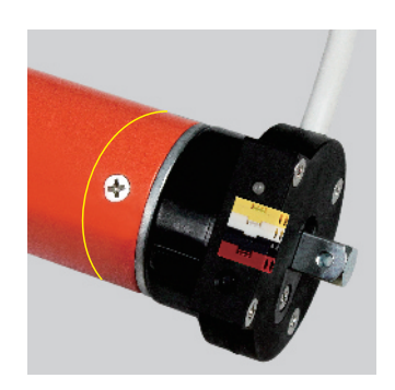
Drum Diameter 55mm