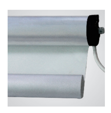
Supporting Capacity 15kg