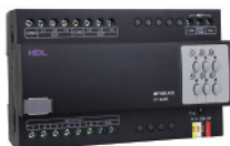
Floor Heating Controller HDL-MFH06.432