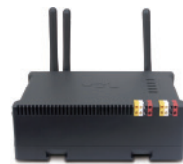
IntelliCenter Controller HDLSERVER-10