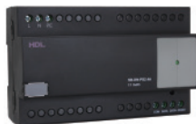
DC24V Power Supply SB-DN-PS2.4A