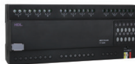
12CH 10A High Power Switch Actuator HDL-MR1210.433