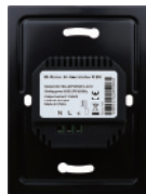
Power Interface With 1ch+3ch Dimmer HDL-MPWPID01LN.16 - EU standard - U.S. standard