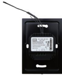
Power Interface With 1ch Relay & Temperature Sensor Input HDL-MPWPIR01T.16 - EU standard - U.S. standard