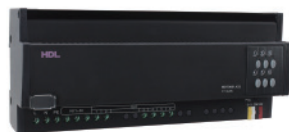
Leading Edge Dimming Actuator HDL-MD0206.432